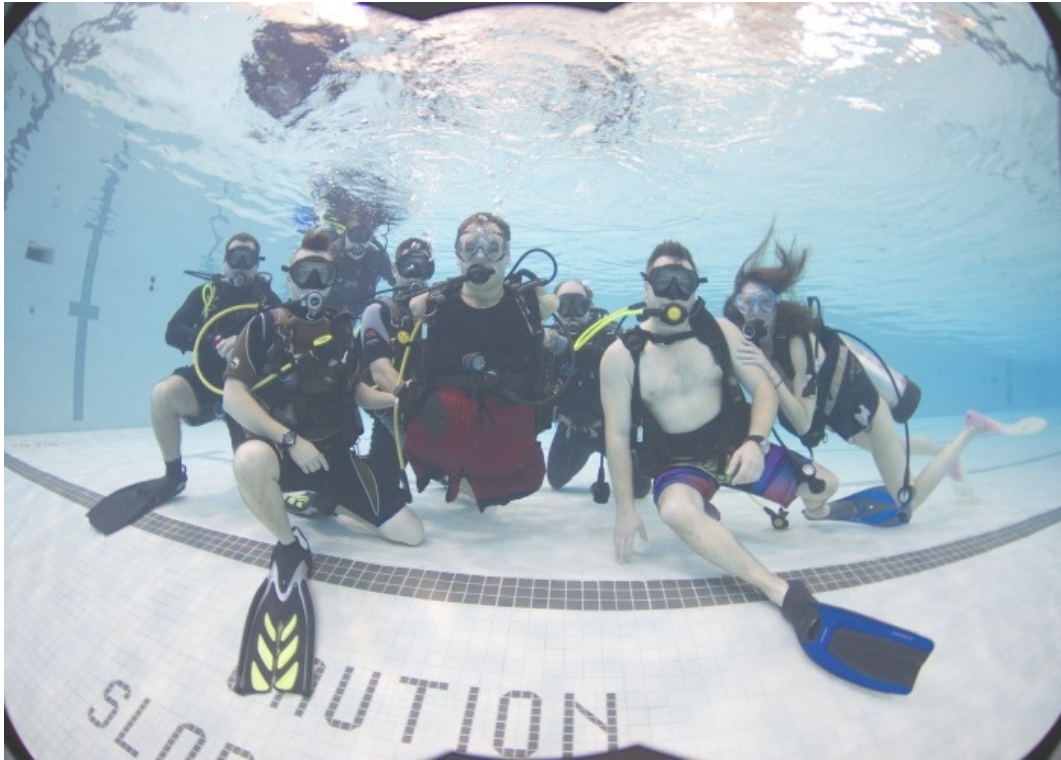
Filming underwater is a fun challenge for the Open Sky production team.