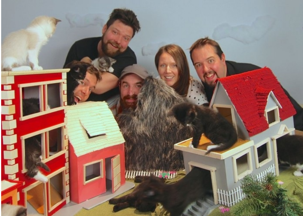
The Open Sky production team on the set of Kitten TV.

relationships with broadcasters,” he says. But he’s excited about the opportunities that are opening up with the changing broadcast paradigm, including new channels, online and streaming services.